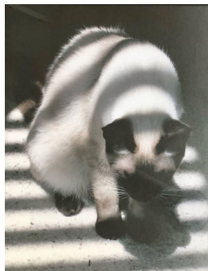
Lani Britain, "Striped Cyborg", Photography