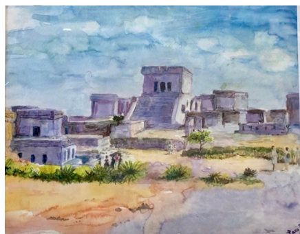
Lani Britain, "Maya Ruins", Watercolors