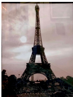
Carmen Lopez, "Eiffel Tower", Photography