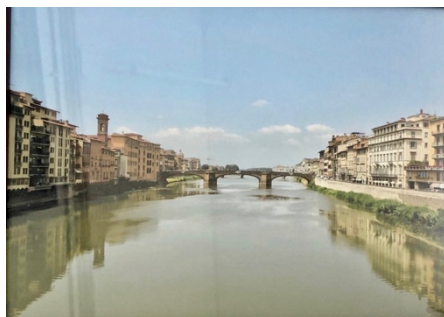
Bill Gorajia, "Florence, Italy", Photography